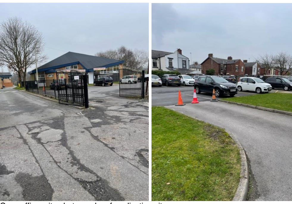
Case officer site photographs of application site.